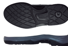
Dual density shoe sole