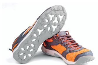
EVA rubber sole for sports shoes