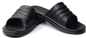
Single density slippers - direct injection