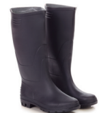
Dual density boots - direct injection